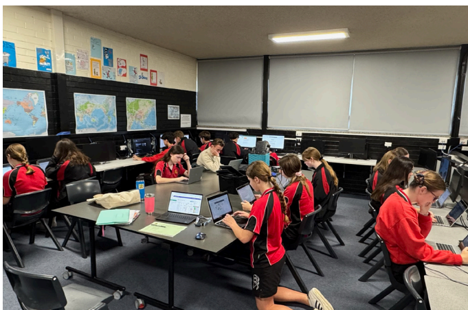
Year 9 HSIE working on their future food sources assessment task.